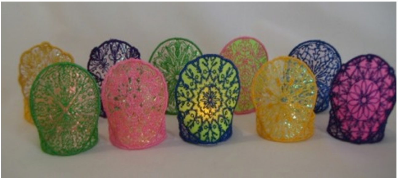
Mylar Tea Light Wraps

Let the wrap sit until glue is completely dry. Finished!