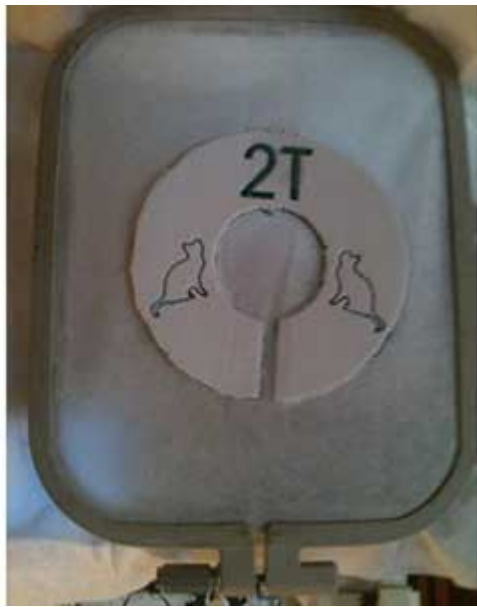
(front of hoop)