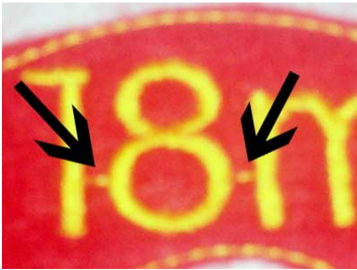
Before with tiny jump stitches