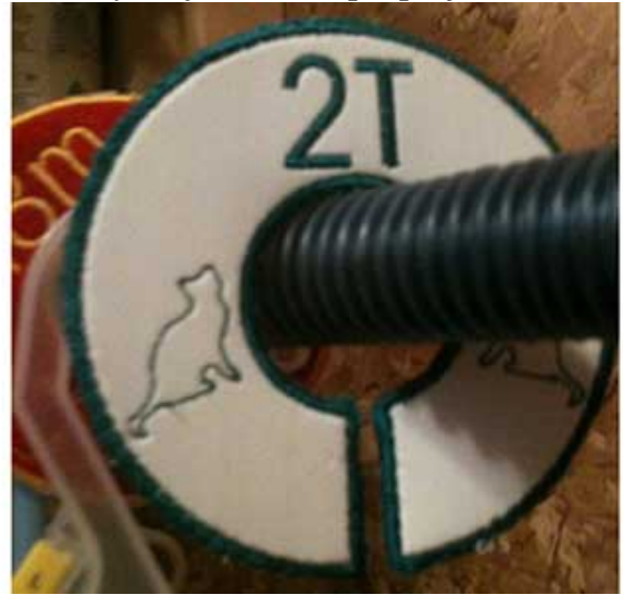
Craft Foam Closet Divider