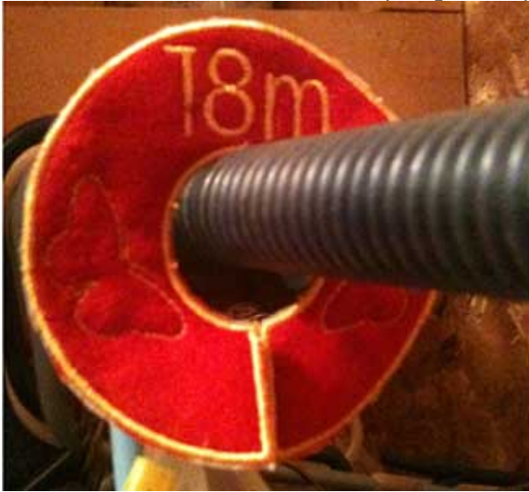
Felt Closet Divider