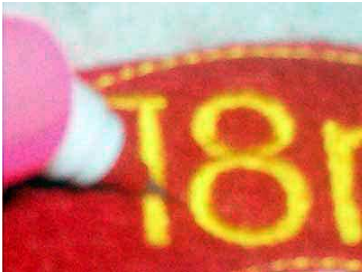
After touching it with a sharpie