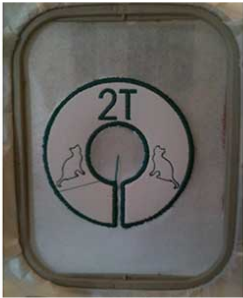
After final satin stitch

Remove from machine and tear away stabilizer. If some of the craft foam is visible on the edges, just take the same color Sharpie as the thread and color the craft foam with it. It covers up any imperfections in the stitching!