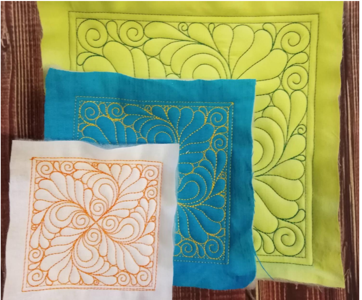
Also in my store