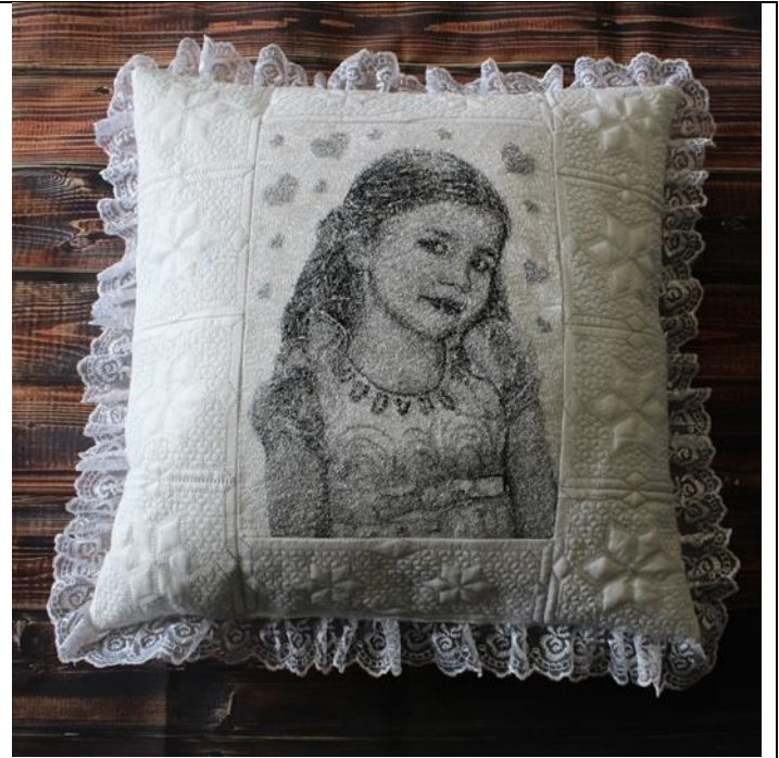
My pillow done

I hope you enjoyed working with my embroidery design.