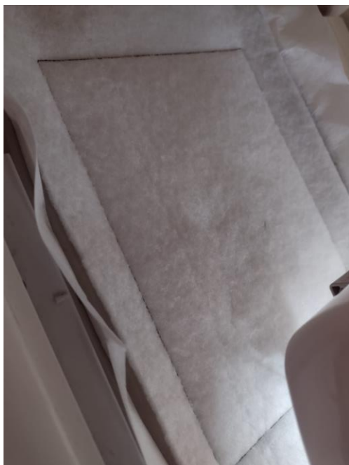
1 Before trim