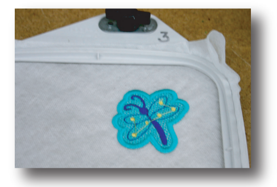
Sew entire design.